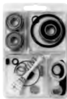
96672 – Motor Tune-Up Kit