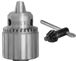
53032 – 1/4" Drill Chuck Includes: 53052 Mated Chuck Key