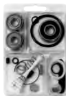
98223 – Motor Tune-Up Kit