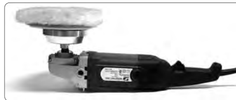
CORRECT Resting Position

Note: Pad may deform and increase vibration of tool.