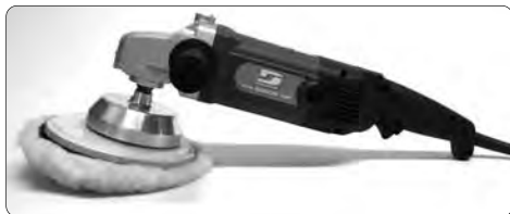
INCORRECT Resting Position

PROPERLY STORING THE TOOL WHEN NOT IN USE WILL ENSURE THE CONTINUED PERFORMANCE.